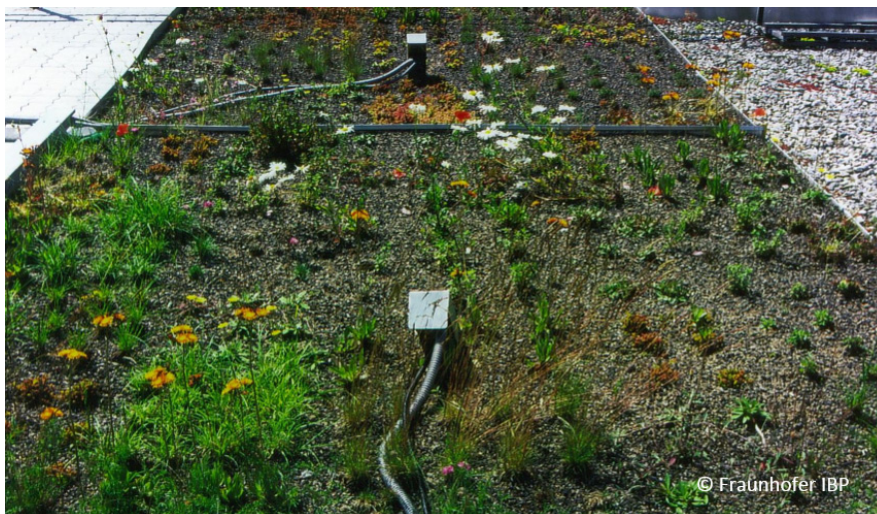
Figure 5. Green roof with temperature and humidity sensors recording the hygrothermal conditions at various positions.

The flat roof is, to the same extent as the external rendering, typical for field experiments. Already in 1957 three test houses were built in order to examine relevant problems of the time. In one case an unventilated flat roof structure with insulating corkboards of 25 mm thickness was compared to a ventilated structure with 15 mm thick corkboards. It was believed that the additional ventilation gap of the structure would save 10 mm insulation material. Today, we talk of more than 200 mm of roof insulation in Germany, because the roof is the most critical envelope component in term of heat losses or solar heat gains.