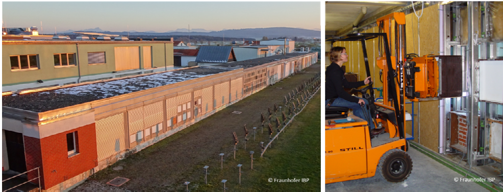
Figure 4. Air-condition test hall with removable wall elements from outside and inside.