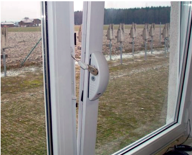
Figure 3: Window ventilation system in fully tilted position.

Should the driving power be insufficient, a ventilator in the duct leading to the solar chimney may be switched on.