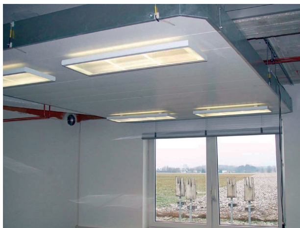
Figure 1: Radiant ceiling panel with integrated lights.

The floor space of the test office amounts to 27 m 2 , the average height is 3 m. At the west side a double-glazed window